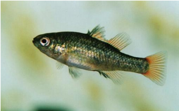
A male southern pygmy perch (© Michael Hammer)