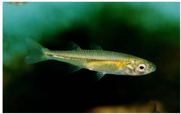
An adult Murray hardyhead